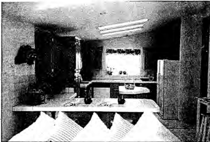
KITCHEN: In the Chardonnay includes a breakfast bar, tile counters, center island and upgraded appliances. Skylights add lots of light.