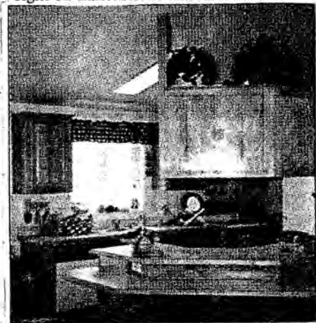
ST. HELENA KITCHEN: Comes with Formica counters, alder and oak style cab-

For more information, call (702) 677-1500. To visit 100 Lancaster, take Highway 395 North to exit 73 (Golden Valley Road). Go left under the freeway, then make a left on North Virginia and right on Lancaster to the sales office.