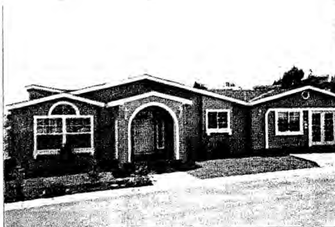
CHARDONNAY: Has 2,280 square feet for $159,900.

Upgraded appliances include a self-cleaning oven; two-door, 24-cubic-foot refrigerator/freezer with ice and water on the door; and built-in microwave.