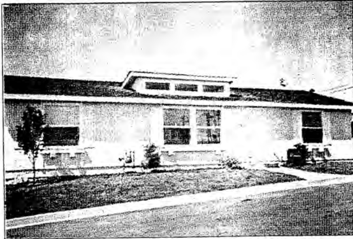
ST. HELENA: Starts at 1,152 square feet for $109,900.