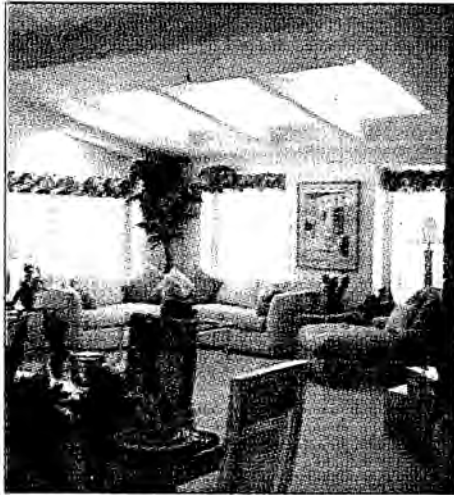
SKYLIGHTS: Add height to this view of the Chardonnay dining room and living. This model backs on to the pitch-and-putt golf course.